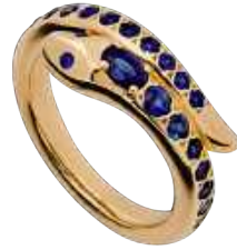
9ct Yellow Gold Snake Ring Set with Sapphires £420.00