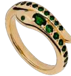
9ct Yellow Gold Snake Ring Set with Tsavorites £470.00