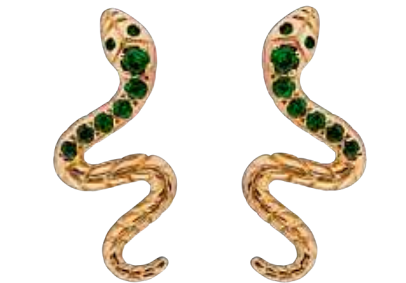
9ct Yellow Gold Snake Earrings Set with Tsavorites £410.00