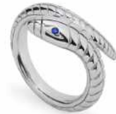
9ct White Gold "Snake" Ring Set with Sapphire Eyes £460.00