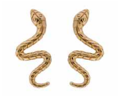
9ct Yellow Gold Plain Snake Earrings £260.00