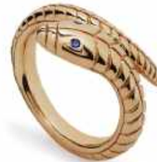
9ct Yellow Gold "Snake" Ring Set with Sapphire Eyes £460.00