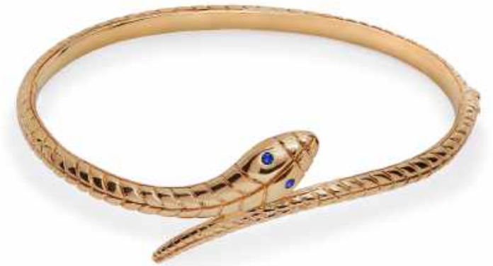
9ct Yellow Gold Yellow Gold "Snake" Bangle Set with Sapphire Eyes £1,430.00