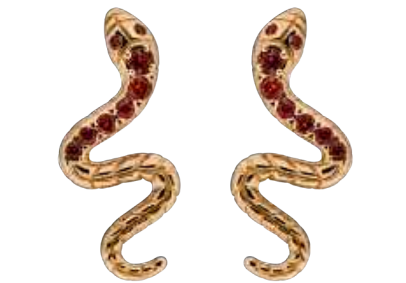
9ct yellow gold Snake Earrings set with Red Spinels £540.00