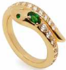
9ct Yellow Gold Snake Ring Set with Diamonds and Tsavorites £1,200.00