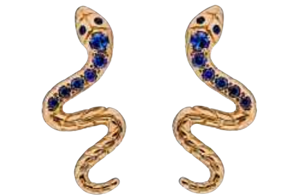
9ct Yellow Gold Snake Earrings Set with Sapphires £360.00