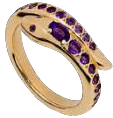
9ct Yellow Gold Snake Ring Set with Amethysts £400.00