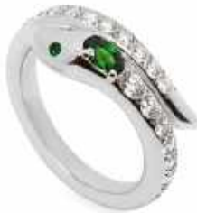
9ct White Gold Snake Ring Set with Diamonds and Tsavorites £1,200.00