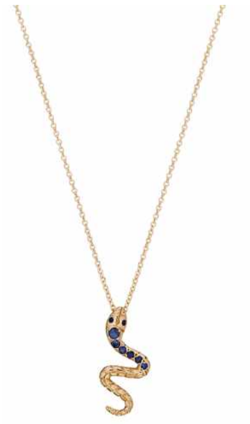
9ct Yellow Gold Snake Pendant Set with Sapphires on 18" Chain £245.00