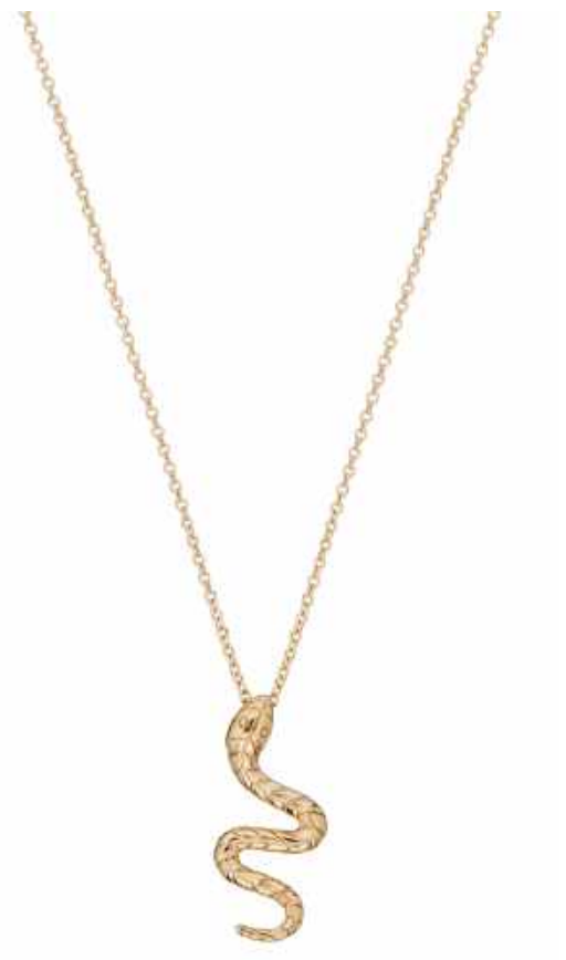
9ct Yellow Gold Plain Snake Pendant on 18" Chain £200.00