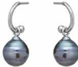
18ct White Gold Hoop Earrings with Interchangeable Black Pearl Drops £1,200.00