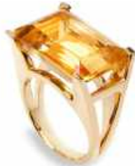
18ct Yellow Gold Claw Set Citrine Ring £1,800.00