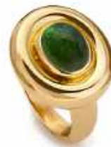
18ct Yellow Gold Ring Rub Over Set with Green Tourmaline Cabochon £3,100.00