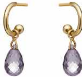
18ct Yellow Gold Hoop Earrings with Interchangeable Amethyst Briolettes £1,200.00