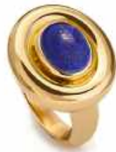
18ct Yellow Gold Ring Rub Over Set with Lapis Lazuli Cabochon £3,100.00