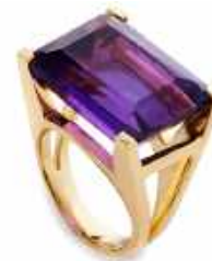
18ct Yellow Gold Claw Set Amethyst Ring £1,600.00