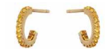
9ct Yellow Gold Hoop Earrings Pavé Set with Yellow Sapphires £180.00