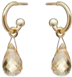
18ct Yellow Gold Hoop Earrings with Interchangeable Lemon Quartz Briolettes £1,200.00