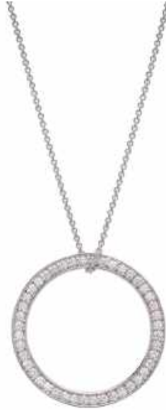
9ct White Gold Diamond Pave Set " Circle of Life' 24mm with an 9ct White Gold 18" Chain £950.00