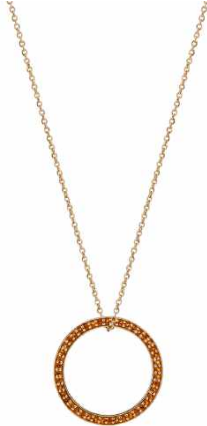
9ct Yellow Gold Circle of Life Pendant Set with Orange Citrine on 18" Chain £265.00