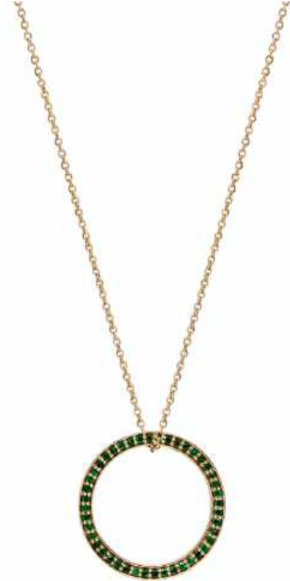
9ct Yellow Gold Circle of Life Pendant Set with Tsavorite on 18" Chain £300.00