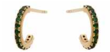
9ct Yellow Gold Hoop Earrings Pavé Set with Tsavorites £180.00