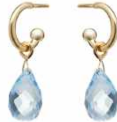
18ct Yellow Gold Hoop Earrings with Interchangeable Blue Topaz Briolettes £1,200.00