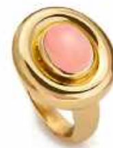
18ct Yellow Gold Ring Rub Over Set with Coral Cabochon £3,100.00