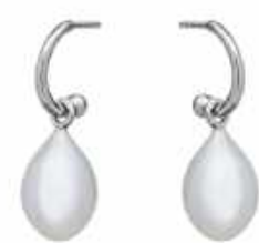
18ct White Gold Hoop Earrings with Interchangeable Pearl Drops £1,200.00