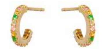
9ct Yellow Gold Hoop Earrings Pavé Set with Multi-Coloured Stones £360.00