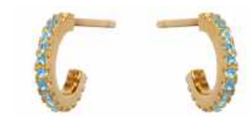
9ct Yellow Gold Hoop Earrings Pavé Set with Blue Topaz £180.00