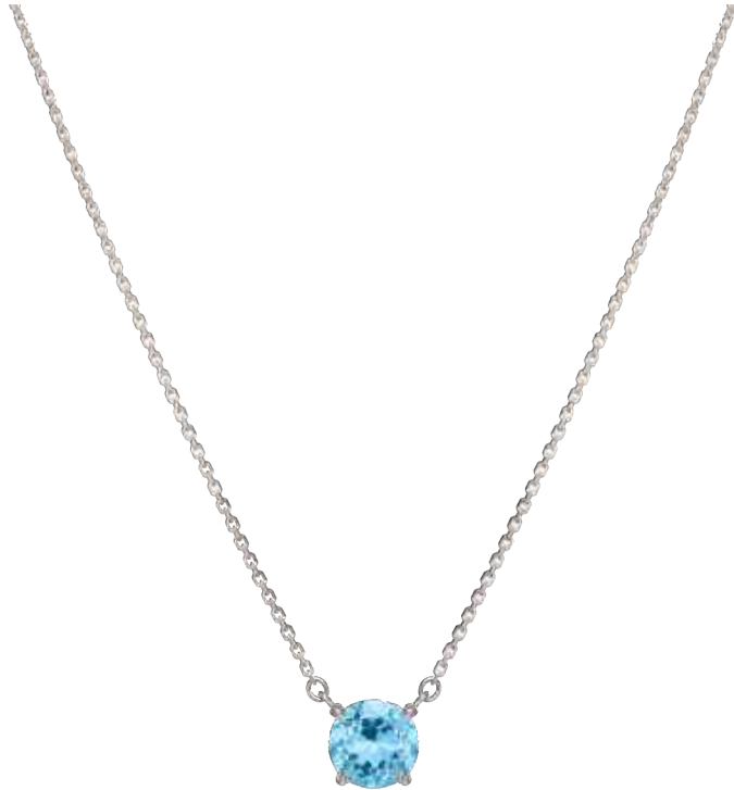
18ct White Gold Claw Set Blue Topaz Round Necklace £640.00