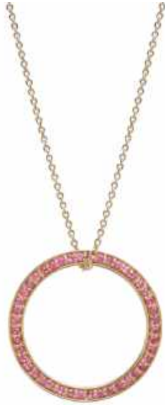
9ct Yellow Gold Red Spinel Circle of Life Pendant on A 9ct Yellow Gold 18" Chain £400.00