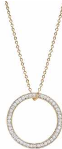
9ct Yellow Gold Diamond Pave Set Circle of Life 24mm with an 9ct Yellow Gold 18" Chain £950.00