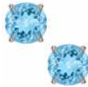
18ct White Gold Blue Topaz Round Stud Earrings 6mm. Also available in 9ct White and Yellow Gold and with other semi-precious, coloured stones £360.00