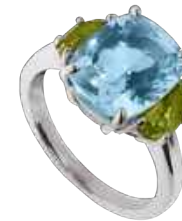
18ct White Gold Claw Set Cushion Blue Topaz and Peridot Ring £1,800.00