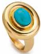
18ct Yellow Gold Ring Rub Over Set with Turquoise Cabochon £3,100.00