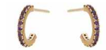
9ct Yellow Gold Hoop Earrings Pavé Set with Amethyst £180.00