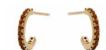
9ct Yellow Gold Hoop Earrings Pavé Set with Orange Citrines £180.00