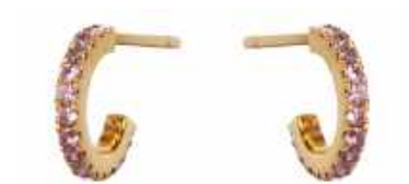
9ct Yellow Gold Hoop Earrings Pavé Set with Pink Sapphires £360.00